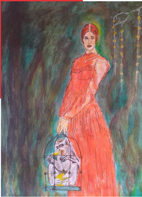
Boysie &amp; Boya by Ewart Forrester